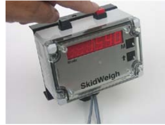
Reset / Print Button

Right Button (Red): Reset and print function of accumulative load weights