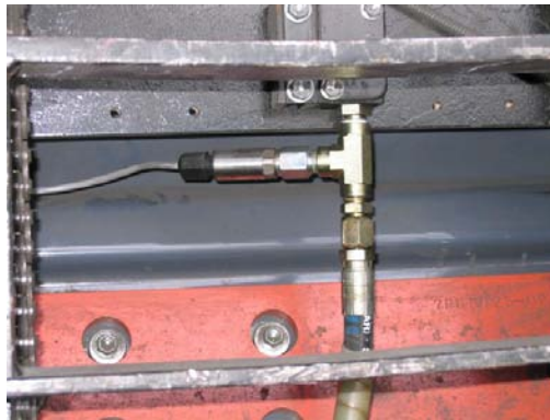
Example of the pressure transducer installation / digital indicator on Toyota forklifts with short mast