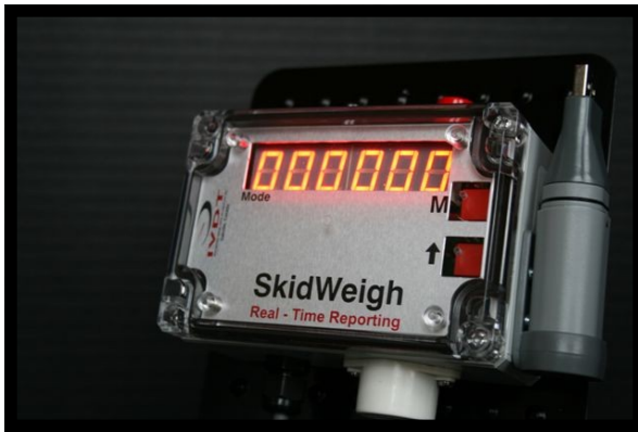
ED2-101 SkidWeigh kit with optional USB data logger

The current status of the vehicle utilization is shown to the lift truck operator all the time. Visual pre-warning to the operator is also shown on LED display as a time out in seconds when vehicle utilization is getting close to the under utilization factor value.