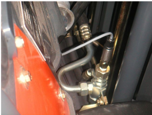
Typical Hydraulic Pressure Transducer Installation

Every time a skid load is picked up the increase in the hydraulic pressure in vehicle lifting circuit will automatically activate the "weighing cycle at sample rate of 1600 readings per second" and convert it to a load weight measurement that is visually presented to the operator via a five digit large display.