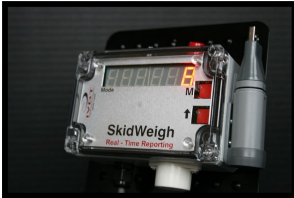
ED2-SM-Buzzer SkidWeigh Kit with optional data logger

When the load weight is not clearly marked or not marked at all and loads are moved and lifted to the different lifting heights, there is a danger of the vehicle stability.